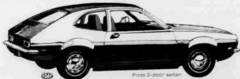
Pinto 2-door sedan

*Based on a comparison of sticker prices for base 2-door models. Optional white sidewalls, plus dealer prep and destination charges, if any, title and taxes, are extra.