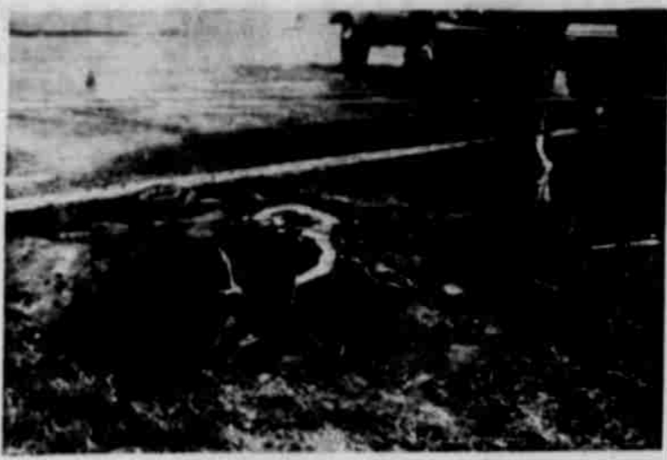
THIS WAS A Juniper tree at the Courthouse that went down in Tuesday's storm. The stump was sawed off and the tree cleaned up in short order. The stump shows the rotten center core.