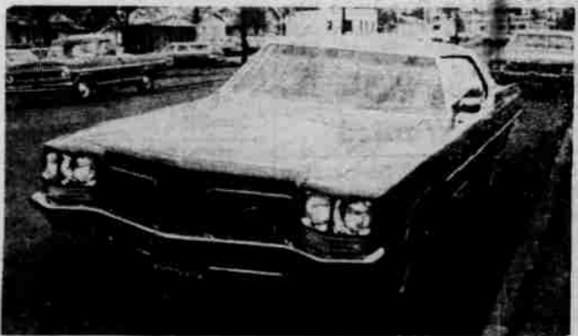
'72 Olds 98 Luxury Coupe