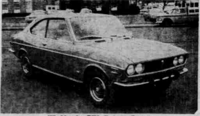
'72 Mazda RX2 Rotary Coupe