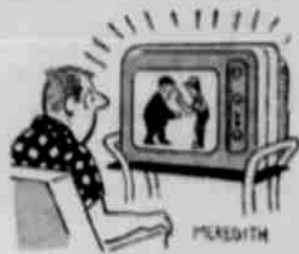
"We'll bring you a video tape of that last play... But first a video tape of that last commercial!"

A booklet that gives information on how to fill out Federal tax returns will be sold at the Heppner Post Office. "Your Federal Income Tax" written by the Internal Revenue Service, has in prior years been sold only at the Government Printing Office, Washington, D. C., or at IRS offices. For convenience of the taxpayer it is now available at nearly all postal installations. This tax guide Publication 17, is now available at the local post office. The price is $0.75 per copy.