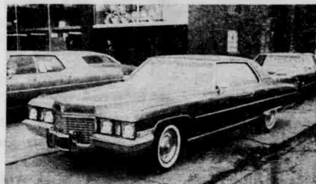
'72 Cadillac Coupe DeVille

Come in and sign up for our Free Lube and Car Wash at CAL'S ARCO