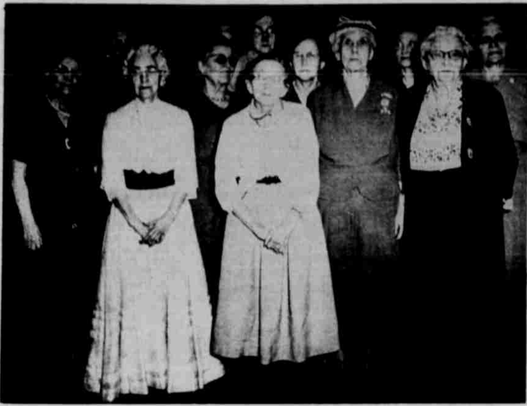
THE GAZETTE-TIMES in the midst of cleaning out some old boxes have found some old cuts that need identification. Anyone who can identify the women in this group are asked to call the Gazette-Times at 676-9228.