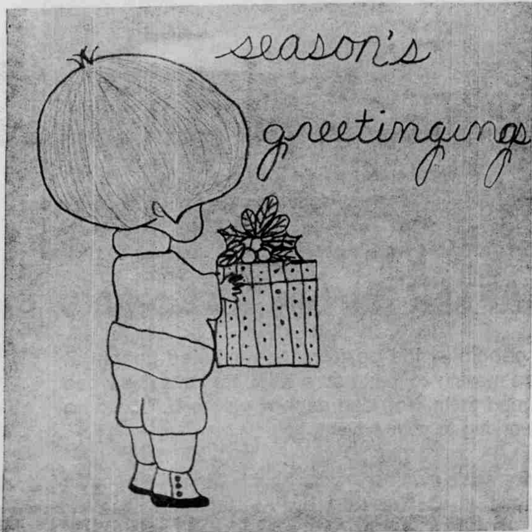
DRAWN BY TAMMIE BRANNON