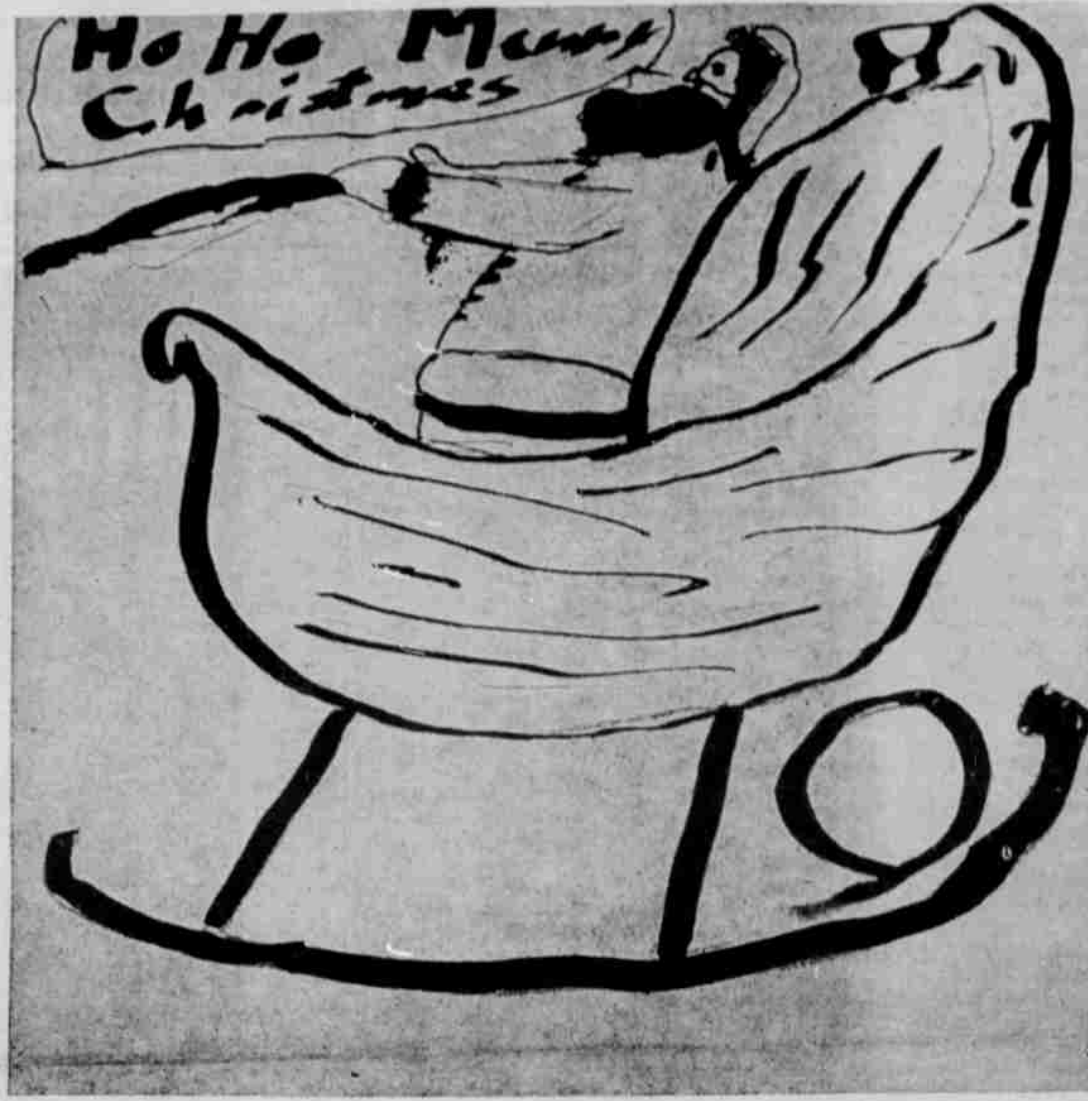
DRAWN BY MARTIN SMITH