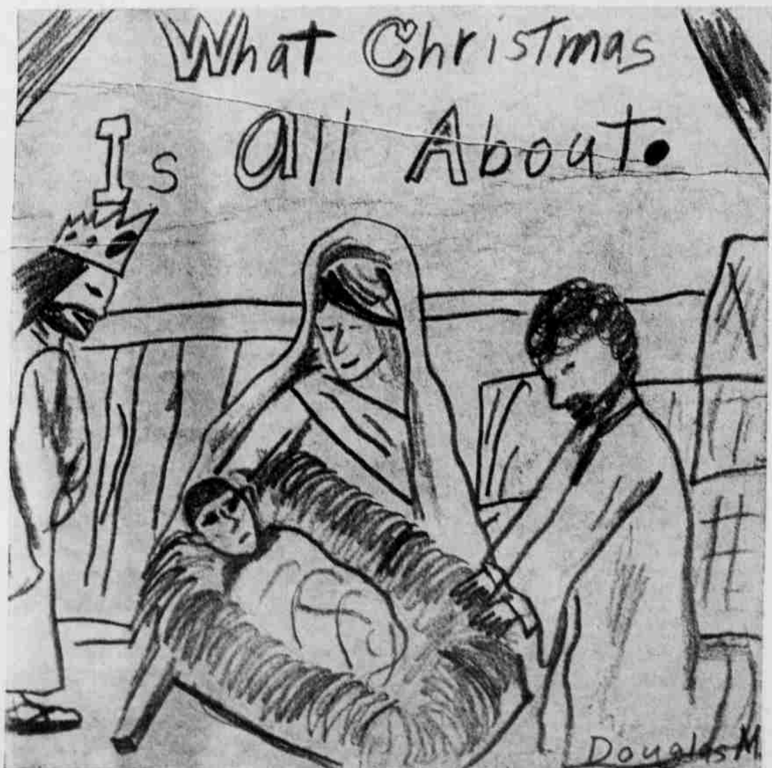
DRAWN BY DOUGLAS MARQUARDT

Small text line for Wagon Wheel Cafe and Lounge advertisement.