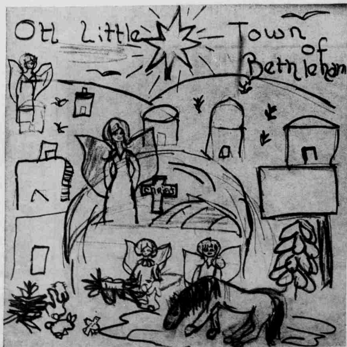
DRAWN BY CINDY MCCONNELL