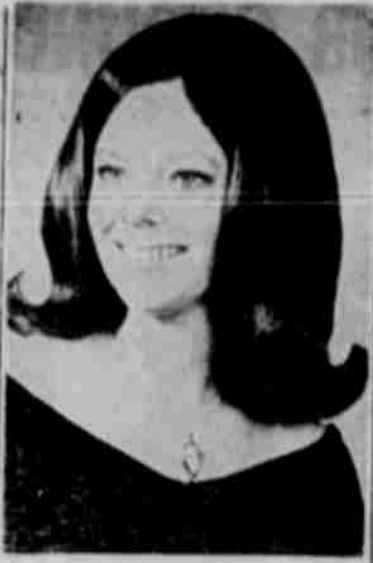
GEORGIA SUSAN HINTON