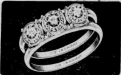
The Mother's Ring by Guerin Brothers / a true original

Christmas means a lot to everybody. Especially the little ones. Every year seems just a little more special, a little more exciting than the one before. But for a mother it's different. She remembers. Warm, personal thoughts, joyful recollections of Christmas past. Each one filled with gaiety, fulfillment... and love. This year, why not give a gift of memories? The Mother's Ring. Twin bands of solid 14K gold. Warm. As warm as the love of husband and wife. United in love by colorful synthetic gems. One for each and every child's birthday. She'll always remember Christmas. But this year's will seem just a little bit nicer.