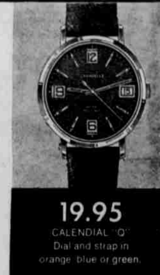
19.95 CALENDIAL "O" Dial and strap in orange, blue or green.