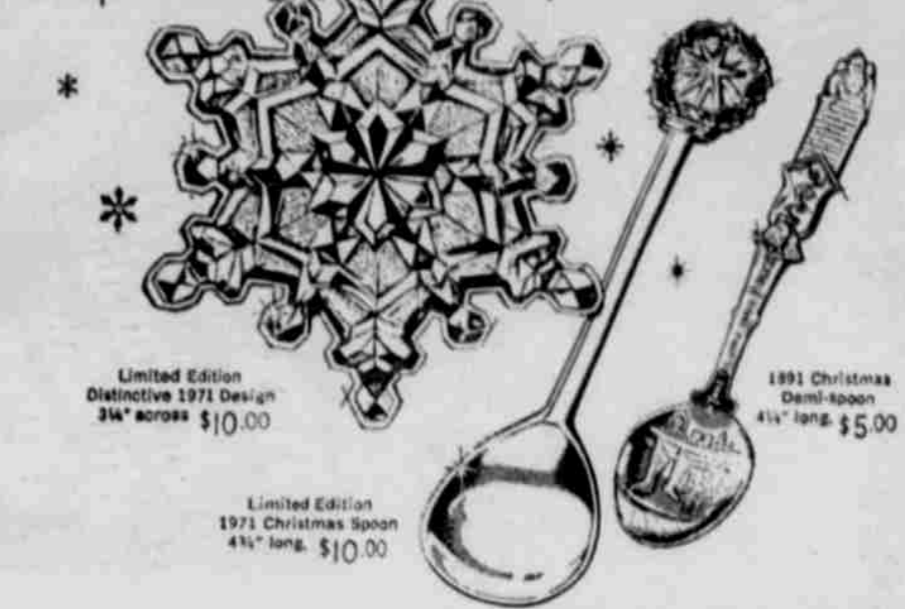
Limited Edition Distinctive 1971 Design 3 1/4" across $10.00