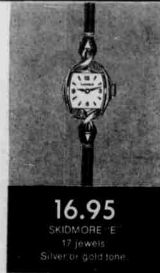
16.95 SKIDMORE "E" 17 jewels Silver or gold tone

Caravelle ® GIFT WATCHES BY Bulova never stop pleasing