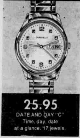
25.95 DATE AND DAY "C" Time, day, date at a glance. 17 jewels.