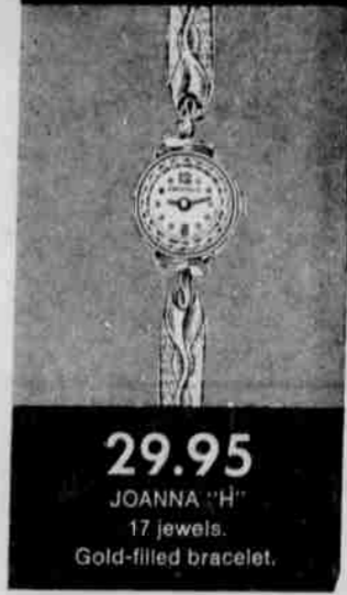
29.95 JOANNA "H" 17 jewels. Gold-filled bracelet.

That's a pretty good price for a watch with a precision jeweled, shock-resistant, anti-magnetic movement, an unbreakable mainspring and a Bulova-backed guarantee. High quality and smart styling... that's why Caravelle is a choice gift. For graduations... birthdays... anniversaries. Father's Day. Mother's Day. Any special occasion. Come see the newest in wrist fashions and features. Caravelle by Bulova. Expensive watches at inexpensive prices.