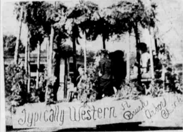
ANOTHER PARADE SHOT: This one is a shot of the Christian Church float in the 1971 Fair Parade "Typically Western". Typical of early days the worship service was held in an outdoor church under a frame covered with tree branches.