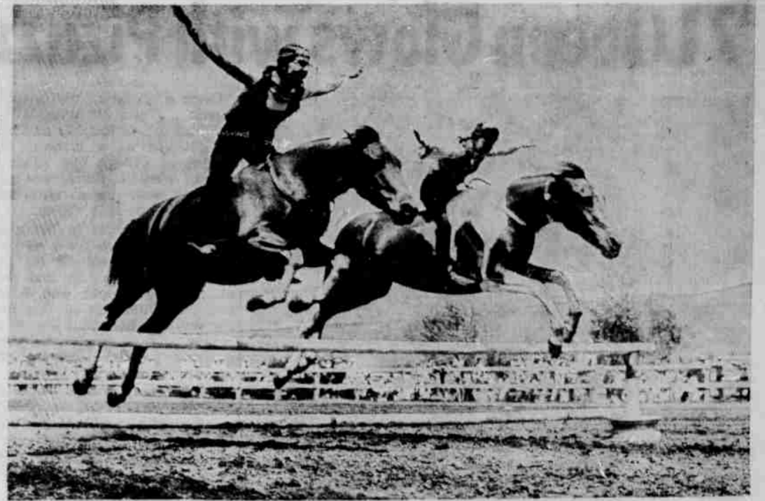
TWO MEMBERS of the Blue Sage Tac Team from Union demonstrate their skill over the bars. These daring jumpers with only a Tac Rein to guide their horses will put on a demonstration at the Morrow County Rodeo Aug. 28 and 29.

Tuesday evening, Aug. 24. Open to Public, 6:00-8:00 p.m. A fair event introduced last year to offer 4-H foods club members the opportunity to show accomplishment in a way comparable to style revue for clothing and knitting members, will be spotlighted again this year on Tuesday evening, Aug. 24, 6-8 p.m. Changes or improvements have been added. Girls prepare their favorite food, exhibit it in a complete setting such as they would use in serving it for a specific occasion. Setting includes table linens, centerpieces, table service and favorite food, complete with recipe, menu, and samples of foods. The event will be open to the public in the 4-H Annex. The girls will be on hand to visit about their "favorite food" exhibit. Food awards will be presented at 8:00 p.m., at the close of the show. All foods club members are encouraged to enter this special event.