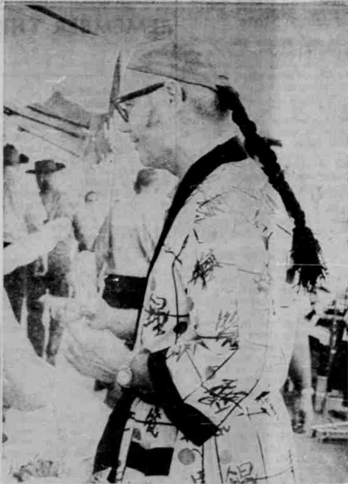
CORN ON THE COB soaked in butter was a popular place to stop and buy. Merchants dressed in everything from the South Sea to China to match the mood of the Sidewalk Bazaar.