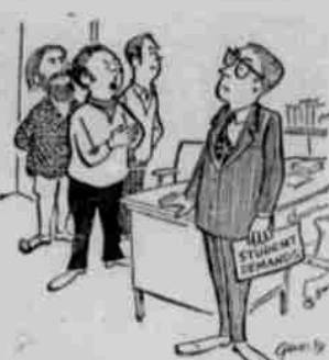
"So let's be objective about it—okay, we object!"

MOORE Pocket Registers, Moore register forms, duplicate and triplicate, and register carbons, available at the Gazette.