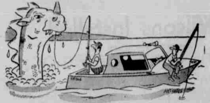
"Harvey, I think I've caught something!"