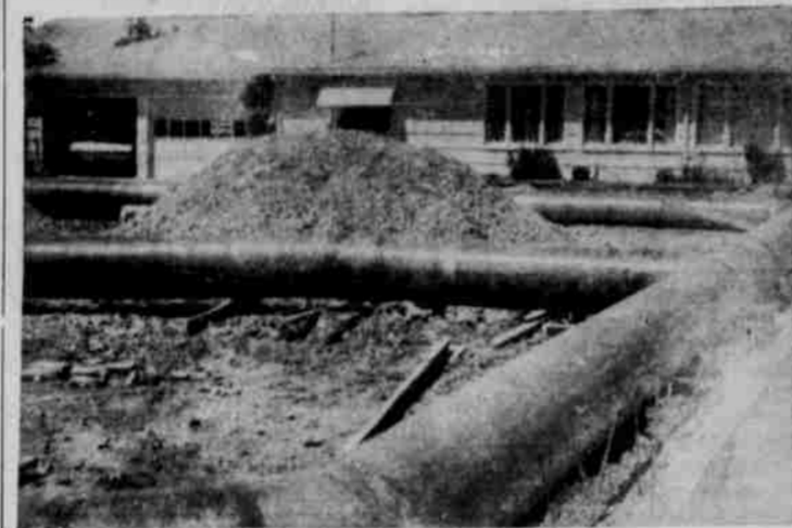
THESE HUGE green plastic pipes are the heating and cooling system of the new St. Patrick's Catholic Church. They are welded in sections with plastic tape. Then dropped into concrete lined trenches. Vents will control the cool or warm air into the rooms.