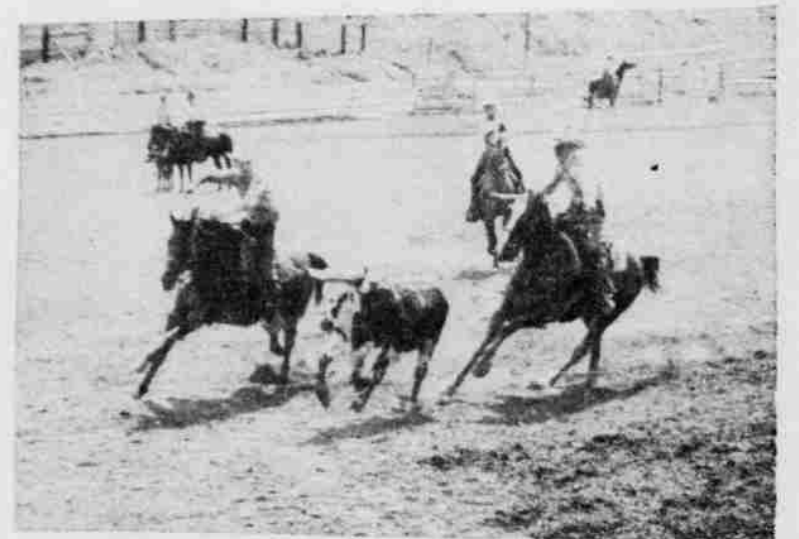
STEER DOBBING is the junior version of Bull dogging. The hazer and contestant ride on either side of the steer. The contestant tries to dobb his paint brush within the circle on the steers ribs.