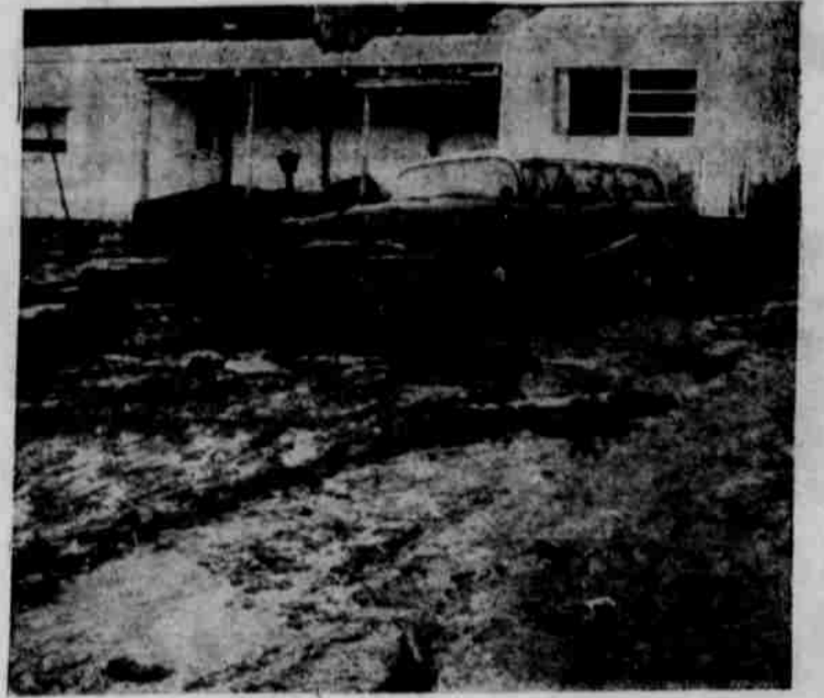
SAM STEERS mobile home lost some underpinings but no water got in.