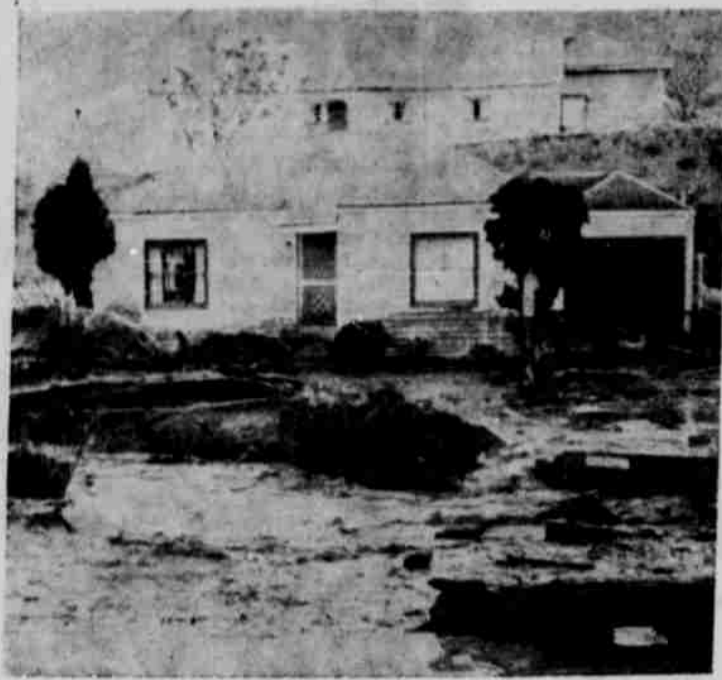
STILL running bank to bank. The bridge is gone to Dave Flanagan. Water was window sill high. In the 1969 flood, they didn't get any water in their house. They live at 330 So. Main, first house above the swimming pool.