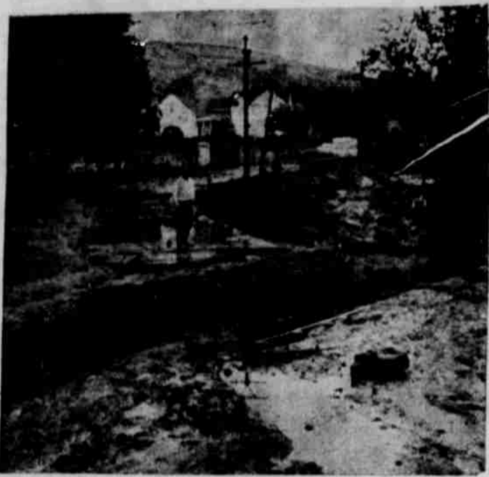
THE MAIN ST. bridge is gone. The water is back in the channel but running bank to bank.