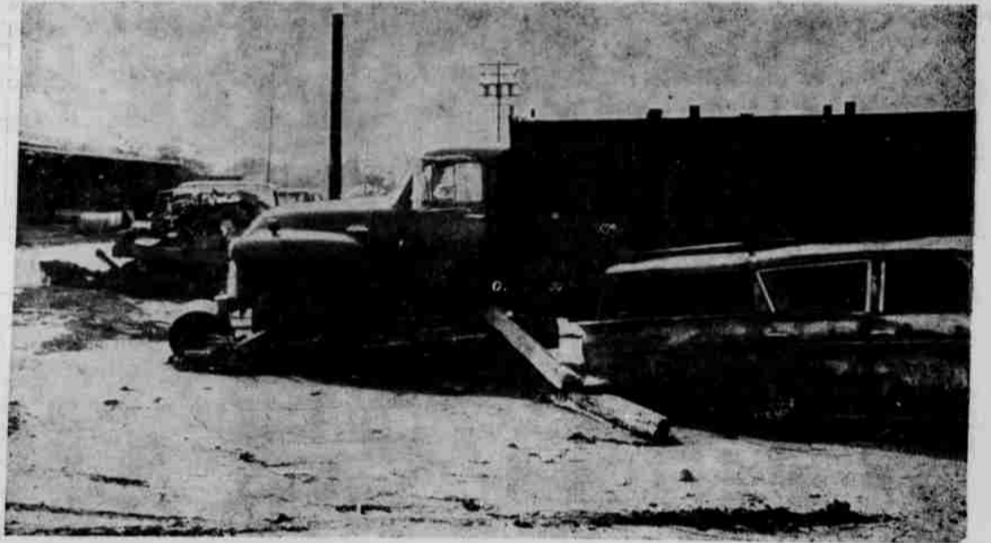
LOWER end of town saw damage too. John Ceglia said the heavily loaded truck on the left was moved 50 yards down the street. Mud and debris is piled up on the truck and touring car.