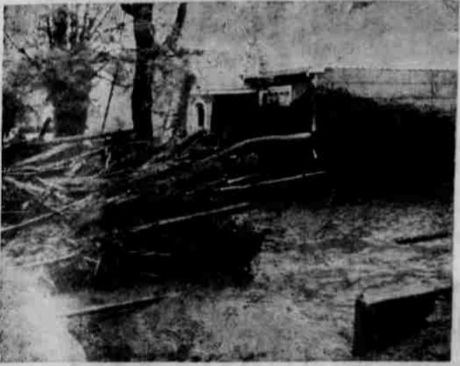
THE LEE BOUTELLE home here shows damage from road paving chunks, mud and debris. (Forest Service photo).