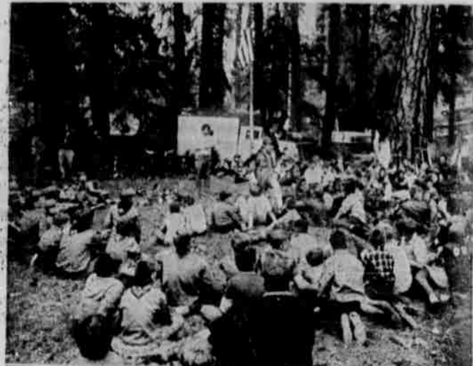
BOY SCOUTS listen to Conservation speakers at the Blue Mountain Council District Camporee.