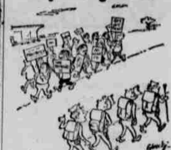
"How can they keep that up all day?"