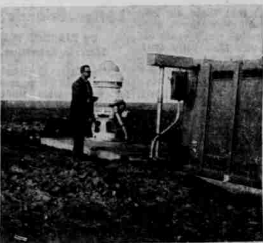
BILL GENTRY stands beside the giant 300 HP pump. Note the absence of poles and overhead wires. The black pipe coming out of the ground to the pump contains the electric lead-in wires.