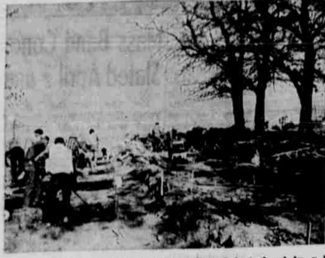
WORKER BEGINS excavation on the first 6 inch level in a 5x5 foot square in Old Umatilla, as other amateur archaeologists work area in background.

appointed for each day, who furnishes supervision and assistance to those working. Club members are all required to take their turns at the different steps in cataloging.