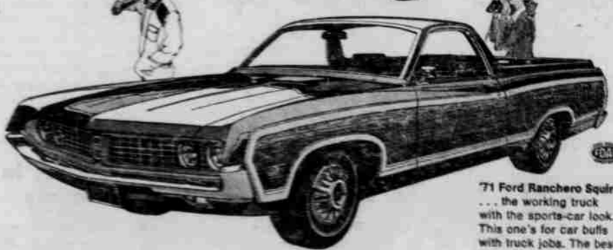
'71 Ford Ranchero Squire... the working truck with the sports-car look. This one's for car buffs with truck jobs. The best of both worlds.

See your Ford Dealer Better Ideas keep us first in the Northwest