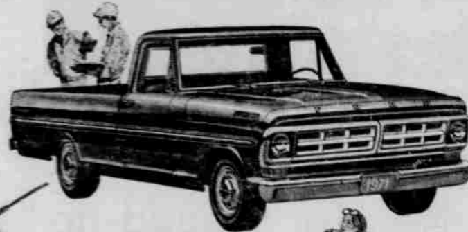
'71 Ford F-100 Pickup with Twin-I-Beam front suspension. Works like a truck, rides like a car. Has the roomiest cab of any pickup.