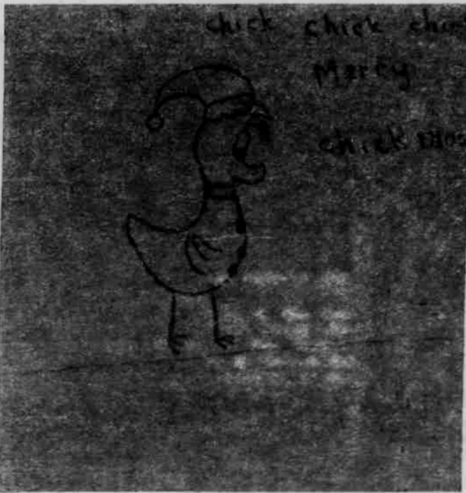
TRACIE BONER, 4th GRADE