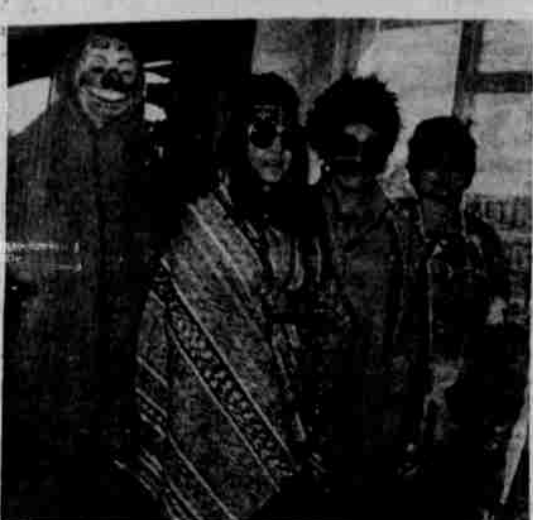
Who is Which? Which is What?