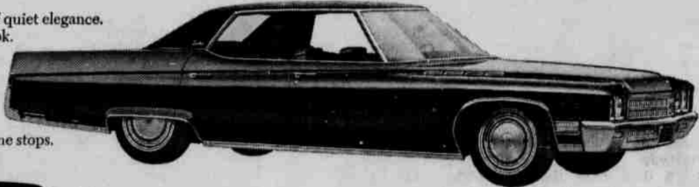
1971 Buick Electra 225. A new interpretation of quiet elegance. We've improved our Electra everywhere you look. There's more room in every direction, interiors that can be appreciated as much for their durability as for their beauty and comfort, even a new balanced braking system. A unique valve proportions braking force front to rear to help give you quick, smooth straight-line stops.