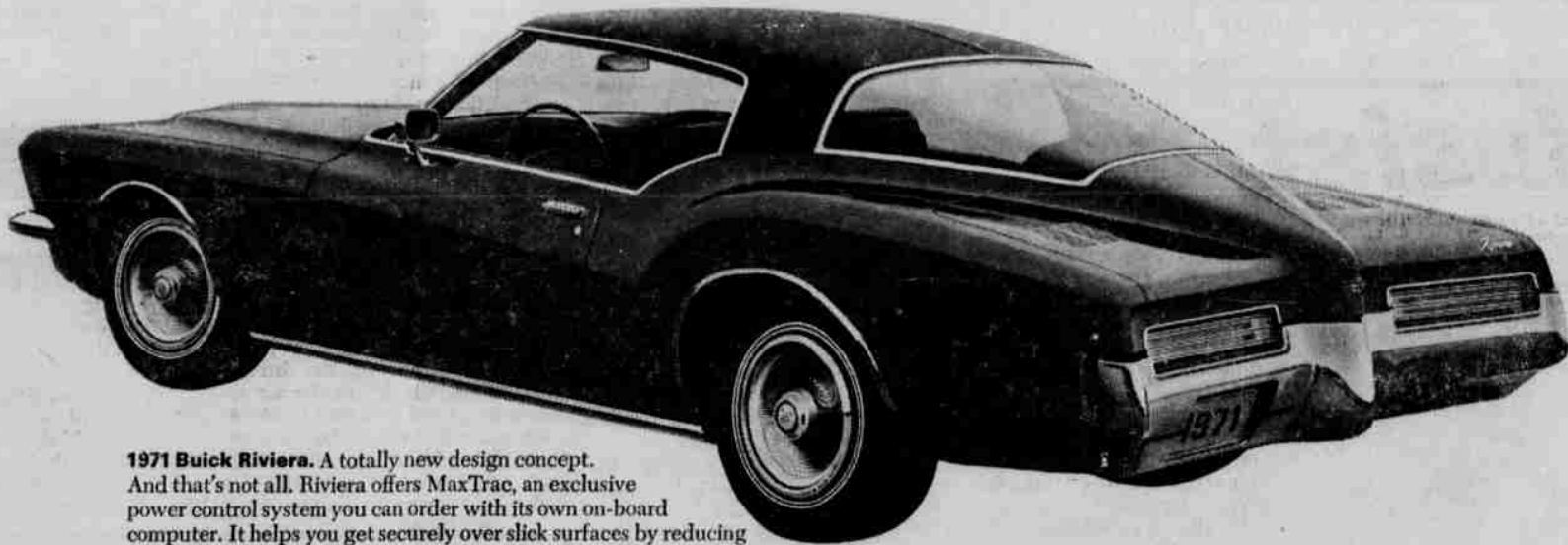
1971 Buick Riviera. A totally new design concept. And that's not all. Riviera offers MaxTrac, an exclusive power control system you can order with its own on-board computer. It helps you get securely over slick surfaces by reducing rear-wheel slipping. The new body features side-guard beams for protection, a bigger trunk, and a driver cockpit with a control center designed around the driver for new ease and convenience.