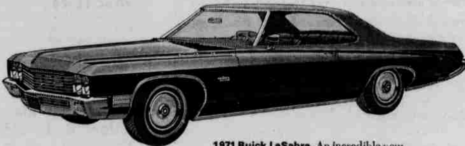
1971 Buick LeSabre. An incredible new offering of Buick value. The LeSabre, like the Riviera, Electra and Centurion, features AccuDrive, a new version of the directional stability system we pioneered. It will help give you smooth handling.