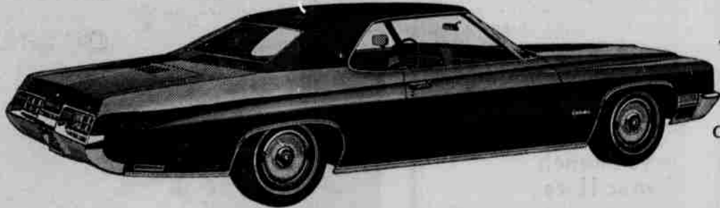
1971 Buick Centurion. This is our newest Buick, a city car with sleekness and grace as well as muscle. It features more nimble variable-ratio power steering, power front disc brakes, Full-Flo ventilation, and a vinyl roof on the Centurion Formal Coupe as standard equipment.