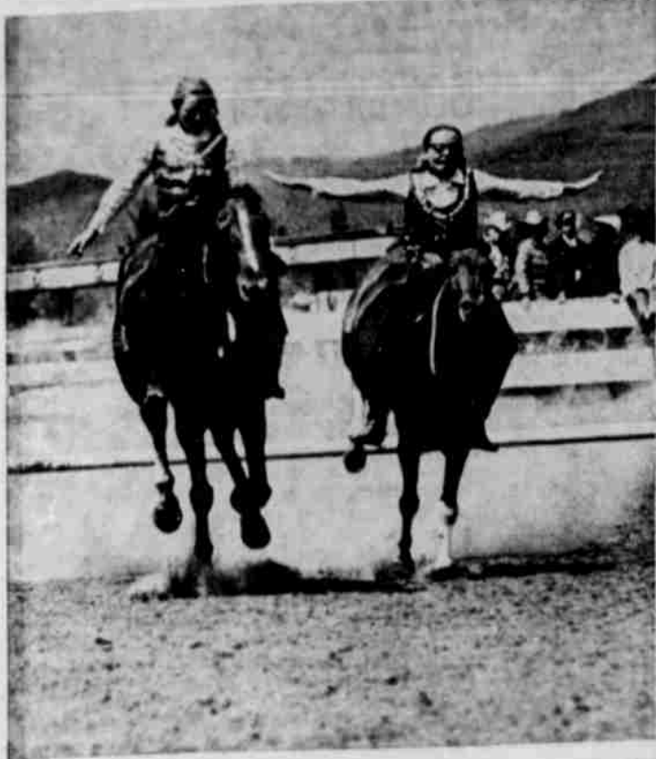
SHOWN HERE ARE several performing members of the Blue Sage Riders of Union, Ore. These lassies are to appear during the Morrow County Fair and Rodeo here.