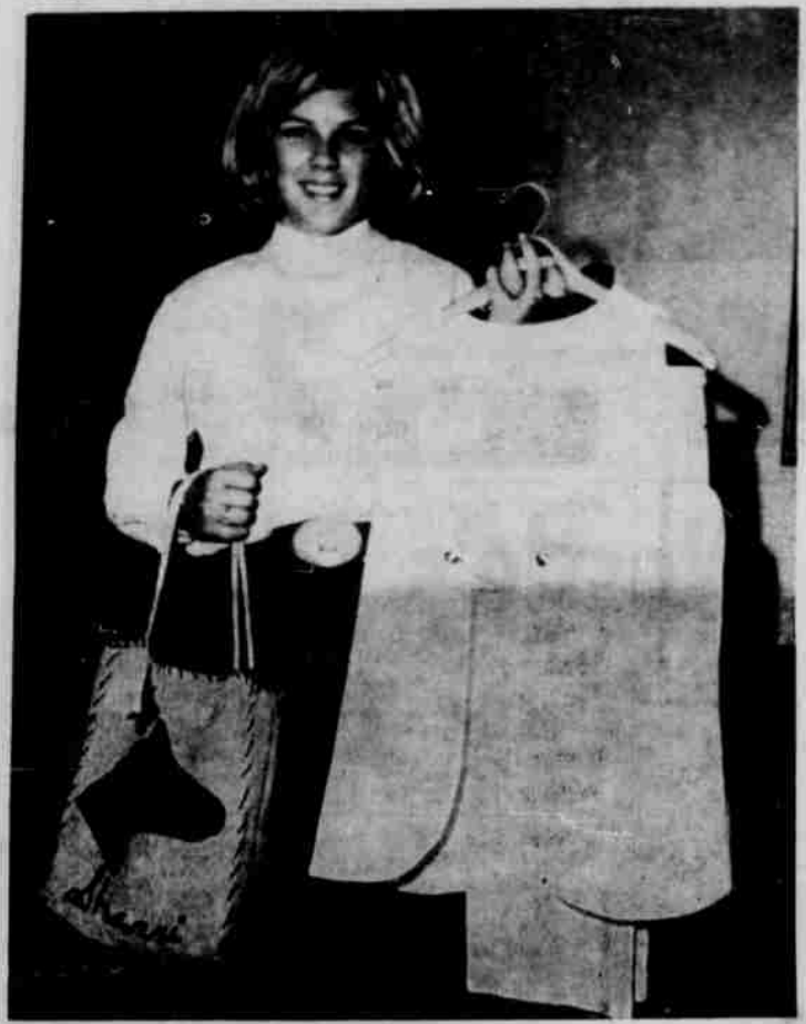
SEWING COMES naturally to Queen Sherri. Here she holds the white informal outfit that she made for Court appearances and