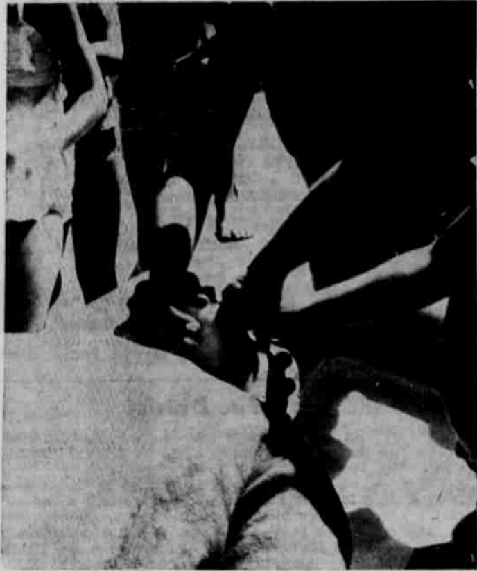
A SWIMMER sweeps his finger through ResusAnnie's mouth to remove any foreign matter.