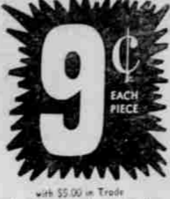
with $5.00 in Trade Punched on Merchandise Card

SAVINGS OF 50% OR MORE ON OPEN STOCK COMPLETE ITEMS!