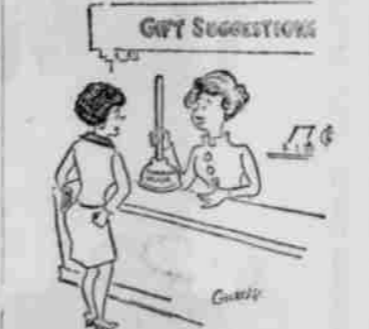
"He'll think of you every time he triumphs over a clogged drain!"