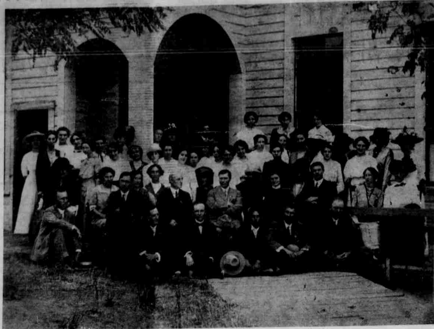
CAN YOU IDENTIFY the persons in this picture? The above photo was found in the wall of the present Heppner Junior High building. It is believed that this picture was taken in front of the old High School that stood on the hill in earlier years. If you have information as to who these individuals are, would you please contact the Gazette-Times office and let us know.