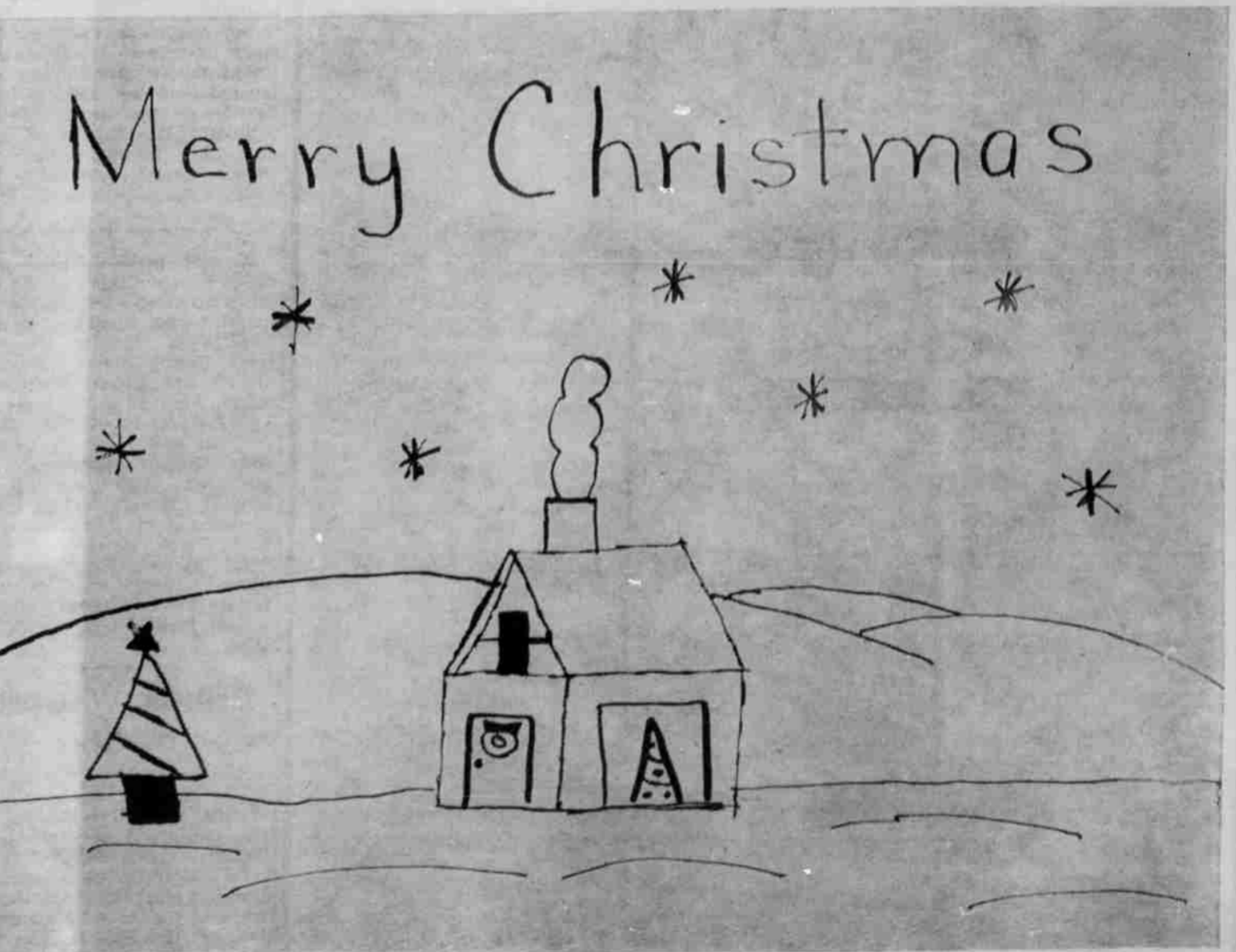
DRAWN BY BRIAN BONER, SIXTH GRADE