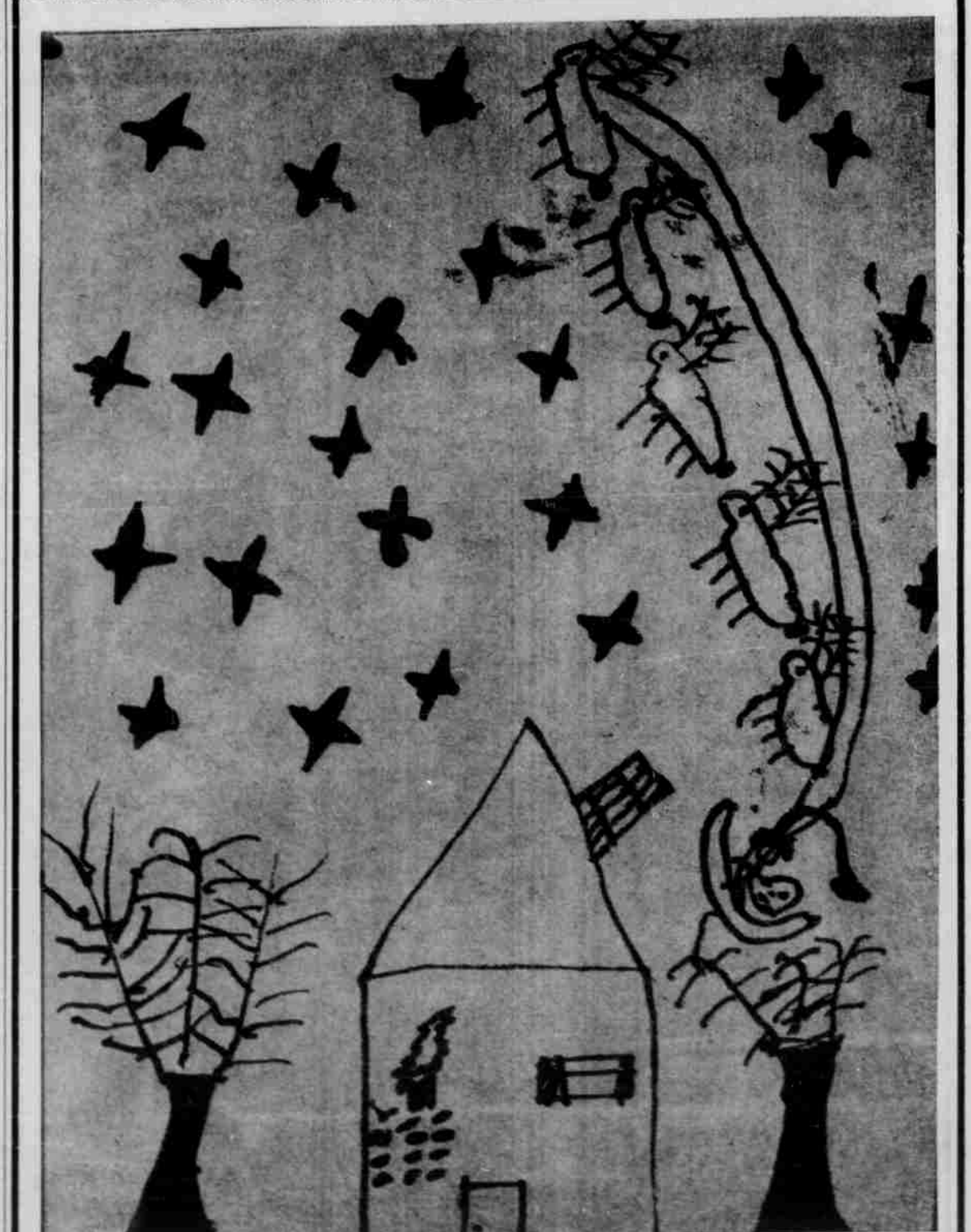
DRAWN BY KEVEN HAGUEWOOD