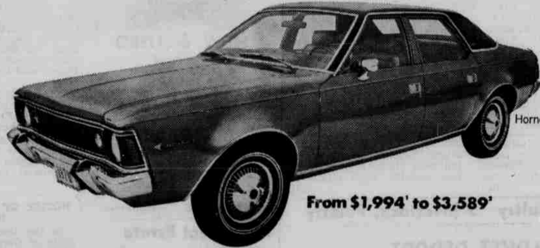
Hornet SST From $1,994* to $3,589*

Starting today, you can see our little rich car, the Hornet, and all our other cars for 1970.