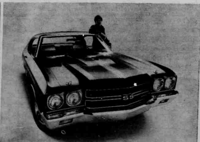
Our tough one: Chevelle SS 396

Monte Carlo. Our whole new field of one. The first truly luxurious personal car even us guys who work for a living can afford. Big 350-cubic-inch V8. Power disc brakes. Deep twist carpeting. All standard. Some car, the Monte Carlo. Some cars will be wishing we had never brought it out. Moving on. Caprice. The perfect car for "the big car man." For 1970 we gave it a new grille, new 250-hp standard V8, new