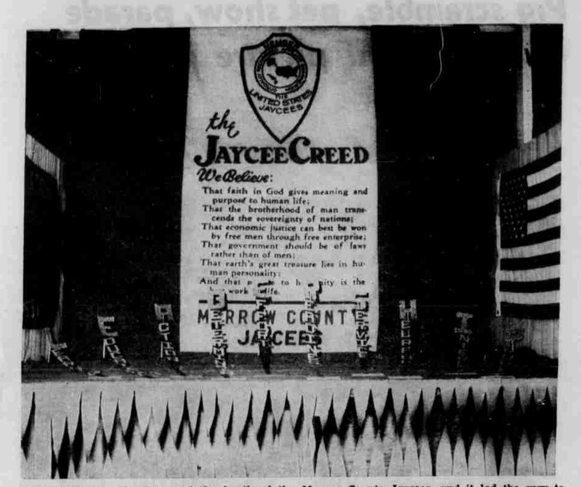
LEADERSHIP was the theme of the booth of the Morrow County Jaycees, and it led the way to the Sweepstakes award at the fair. It was also first place in Community Service division.