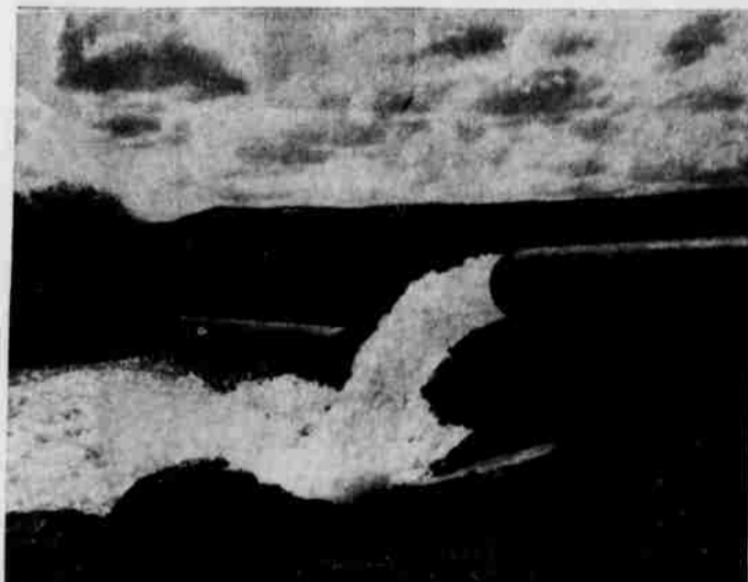
An Intervalley-Drilled well providing 1000 gallons per minute.

OVER 25,000,000 Gallons Per Day Come From Wells Drilled by OTTO ELLSWORTH of INTERVALLEY Drilling Co. In Morrow County over the past 3 years