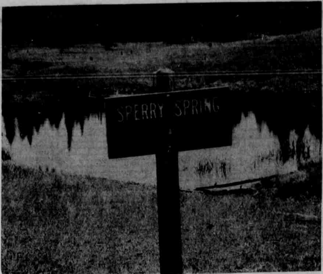
SPERRY SPRING is an attractive scene on a hot summer day. The spring is located near Tupper Guard Station in the Umatilla National Forest about 30 miles south of Heppner.