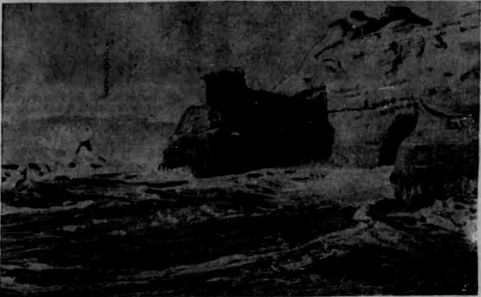
A breaker explodes against an offshore rock, at Cape Kiwanda.

Oregon's unspoiled splendor, its peace and beauty virtually unchanged from the land pioneers sought so fiercely, remains untouched by many of the problems which harass so much of the rest of the country. Its air is unpolluted, its streams pure, its beaches and parks uncluttered. This majestic, tension-free state, tenth in size but only 30th in population, comes vividly to life in the latest in the famed Armchair Travelogue series in The Reader's Digest. Captured in color scenes like these at famed Glacier Lake and Cape Kiwanda, Oregon's continuity with the past, with the splendor of an unspoiled America, will offer the reader renewed hope and confidence.