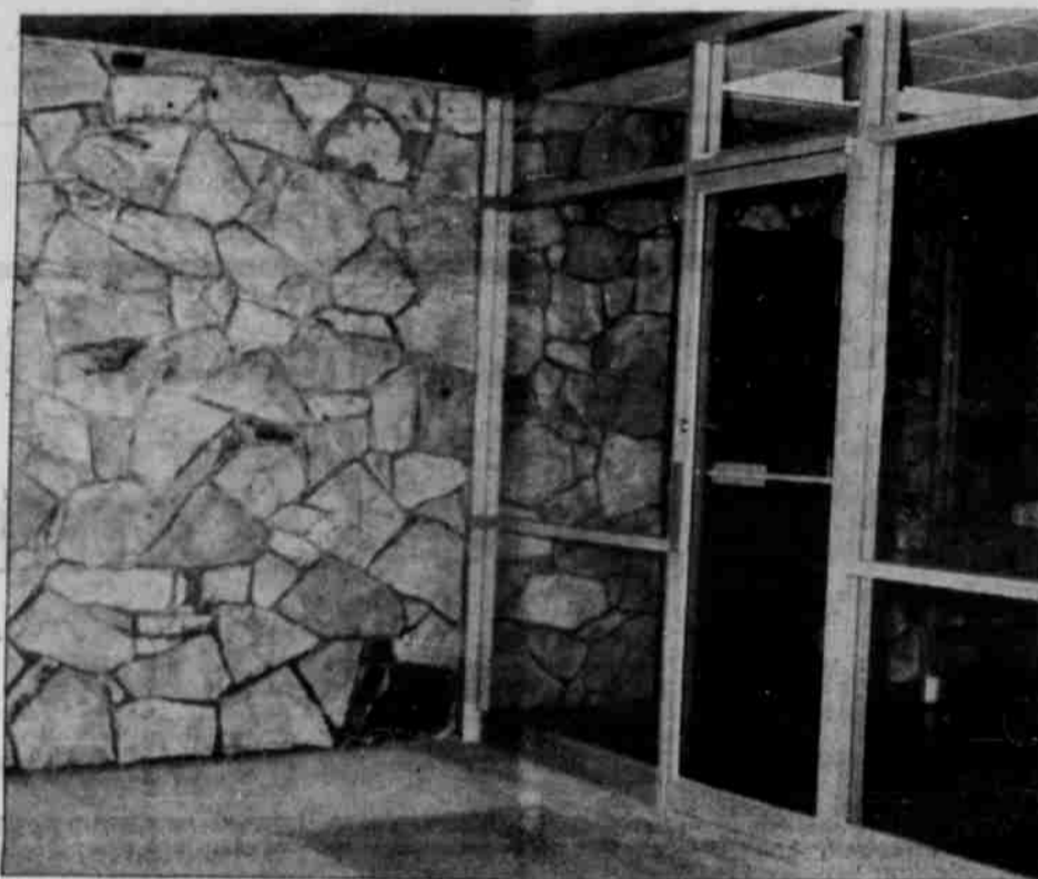
STONE FROM Eagle Creek Stone Quarries, Antelope, sets off entrance to the building and provides beautiful exterior finish.

Columbia Basin Electric helps open the doors to progress for Morrow, Gilliam and Wheeler Counties