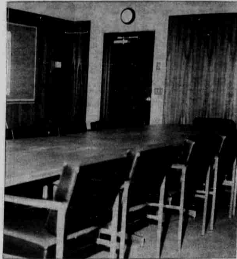
THIS IS A VIEW of the conference room in the new building. It is available for small public meetings. Furniture was purchased from Cais Office Supply, The Dalles. Floor coverings are by Pendleton Floor Covering.