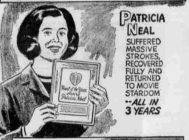
PATRICIA NEAL SUFFERED MASSIVE STROKES, RECOVERED FULLY AND RETURNED TO MOVIE STARDOM -- ALL IN 3 YEARS