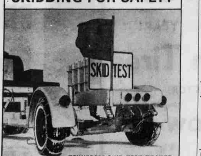
TENNESSEE SKID TEST TRAILER —one of the devices used by the National Safety Council's Committee on Winter Driving Hazards during its annual winter test project to measure the stopping ability of various types of tires, chains and other equipment.