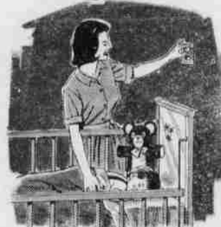
SAFE. No dangerous flames or fumes. Electric heat is flameless; just as safe as a light bulb.