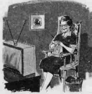
COMFORT. Select the "just right" temperature for every room. No "cold spots" or drafts.

Get the facts about low-cost Electric Heat. No obligation!