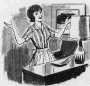
CLEAN. No soot or oily films to dirty your home. Electric heat cuts cleaning chores up to 50%!