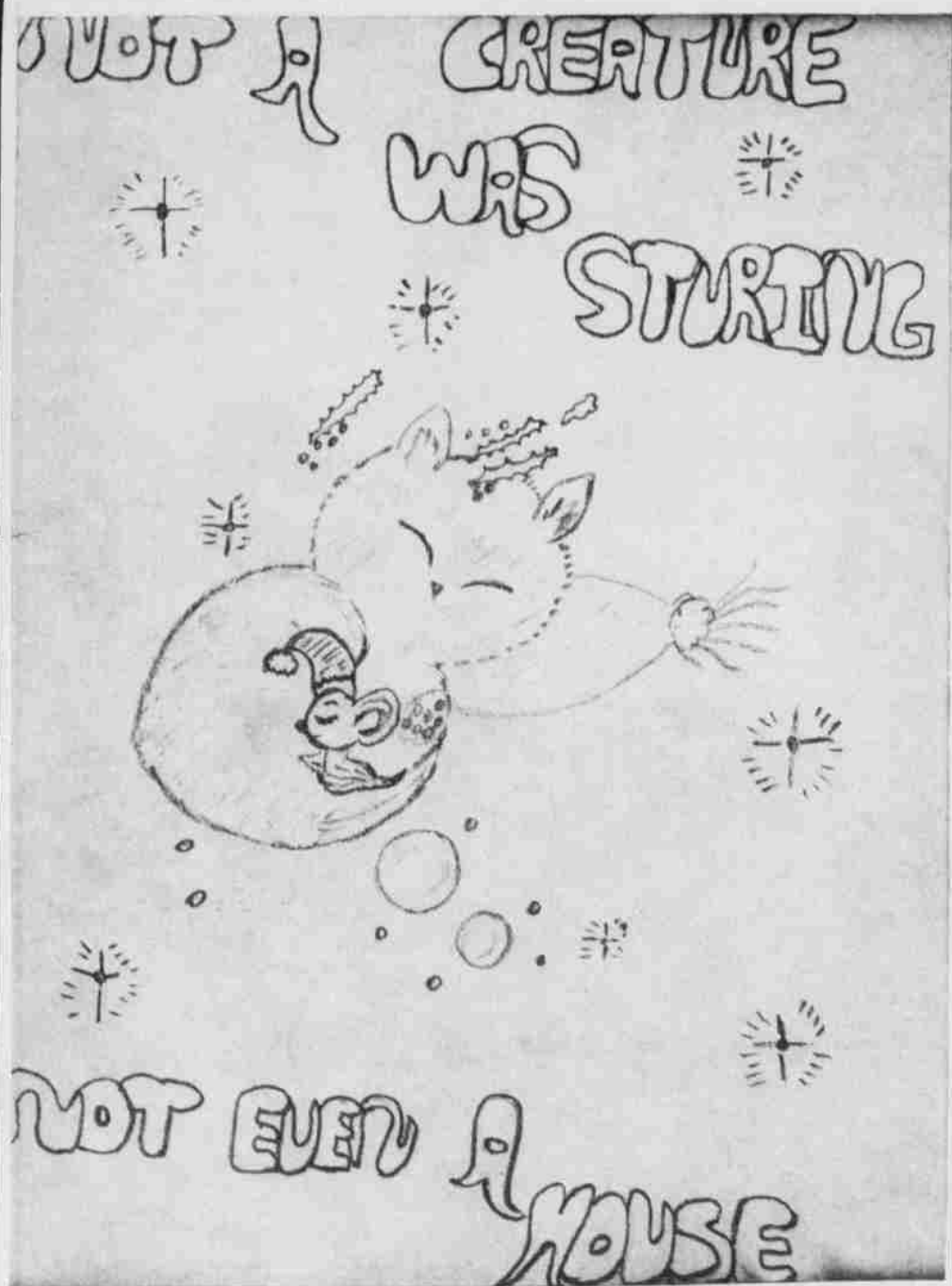
DRAWN BY JILL SCOTT, 8th GRADE