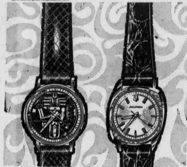
ACCUTRON SPACEVIEW "18" Clear view dial arrangement, waterproof, sweep second hand, luminous hands and dots, black Python strap. $125.00

An all-new Zippo... slender... light in weight... with famous Zippo action for sure, easy lights! Perfect gift for men and women! $6 to $20 Ribbon Design Slim-Lighter $4