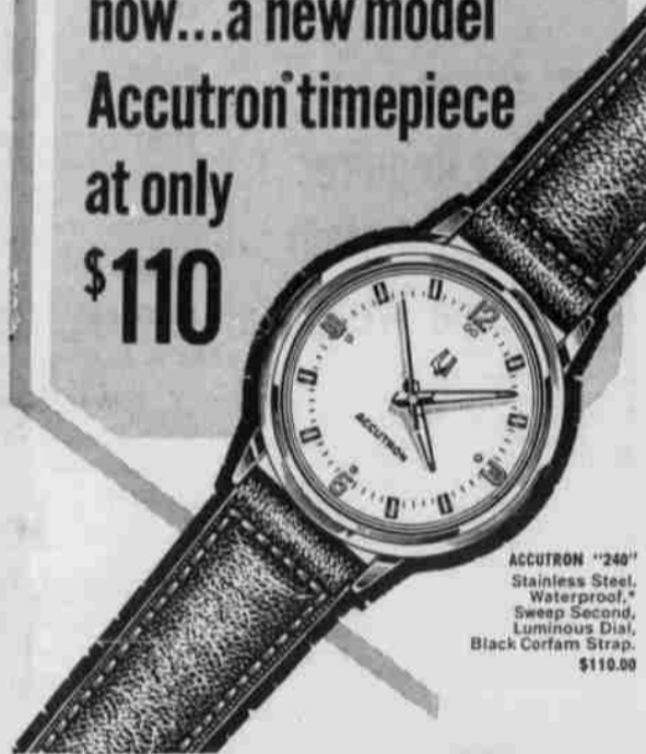
ACCUTRON "240" Stainless Steel, Waterproof, Sweep Second, Luminous Dial, Black Corfam Strap. $110.00

now... a new model Accutron timepiece at only $110