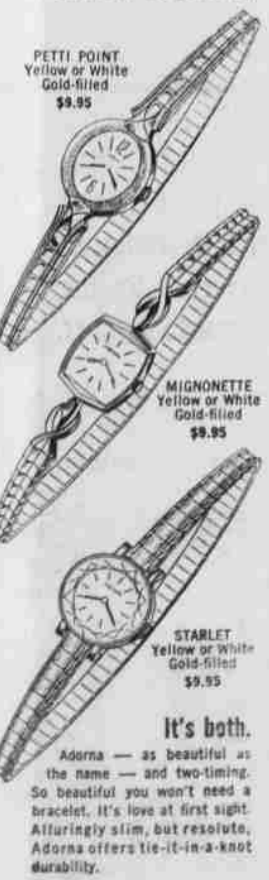
PETTI POINT Yellow or White Gold-filled $9.95

new Adorna by Speidel ...is it a watchband ...or a bracelet?