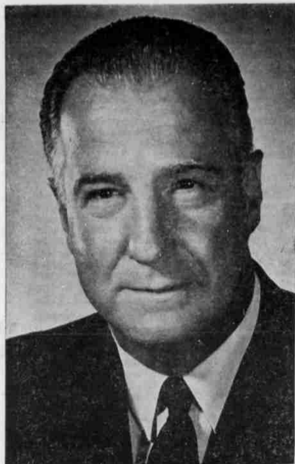
SPIRO T. AGNEW