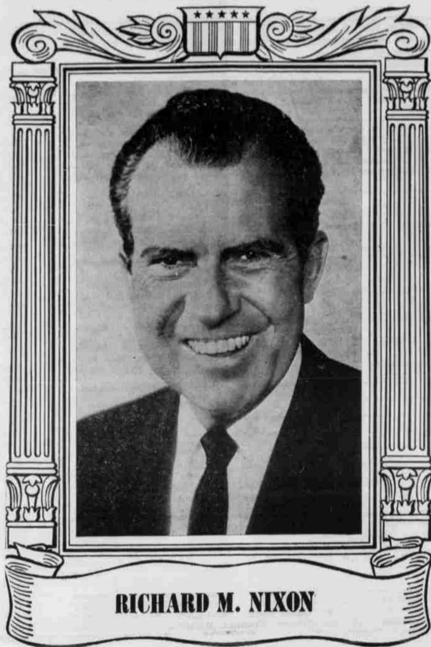
RICHARD M. NIXON