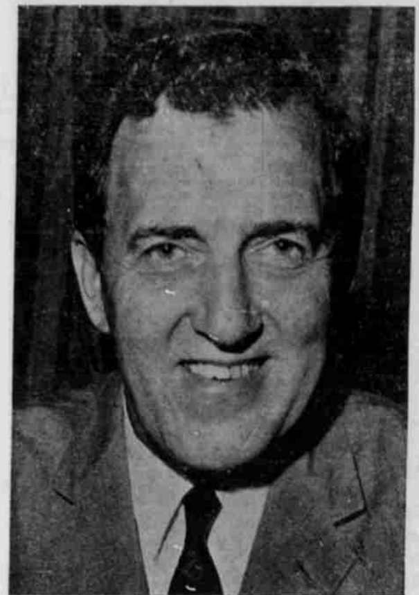
EDMUND S. MUSKIE

THERE IS STILL MUCH TO DO. WE NEED WAYNE MORSE.