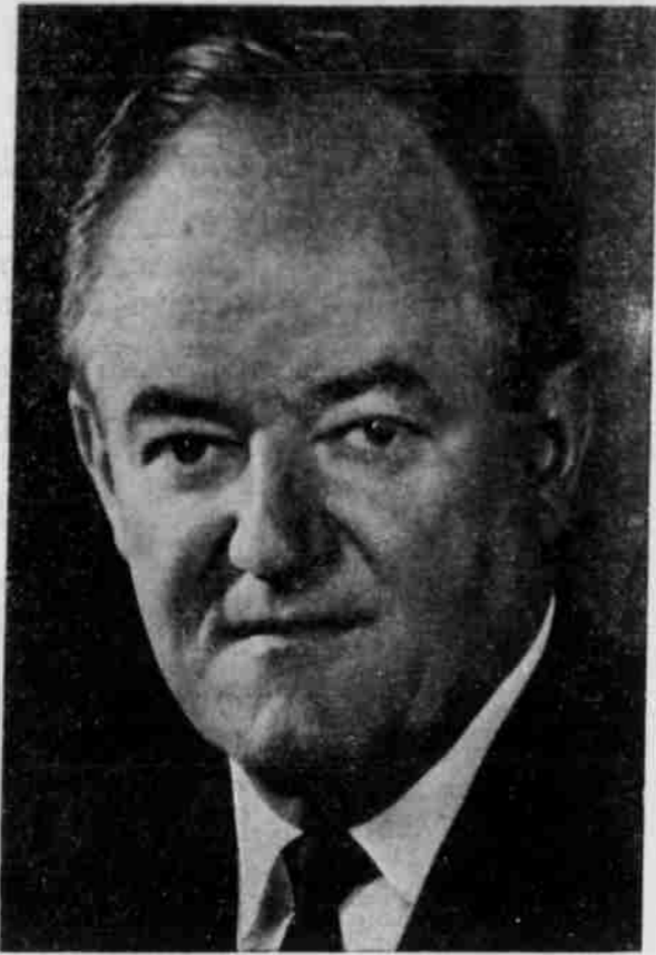
HUBERT H. HUMPHREY Democrat, For President

THE TIME HAS COME TO SPEAK OUT IN BEHALF OF AMERICA . . . NOT A NATION THAT HAS LOST ITS WAY, BUT A RESTLESS PEOPLE, A GREAT NATION STRIVING TO FIND A BETTER WAY.