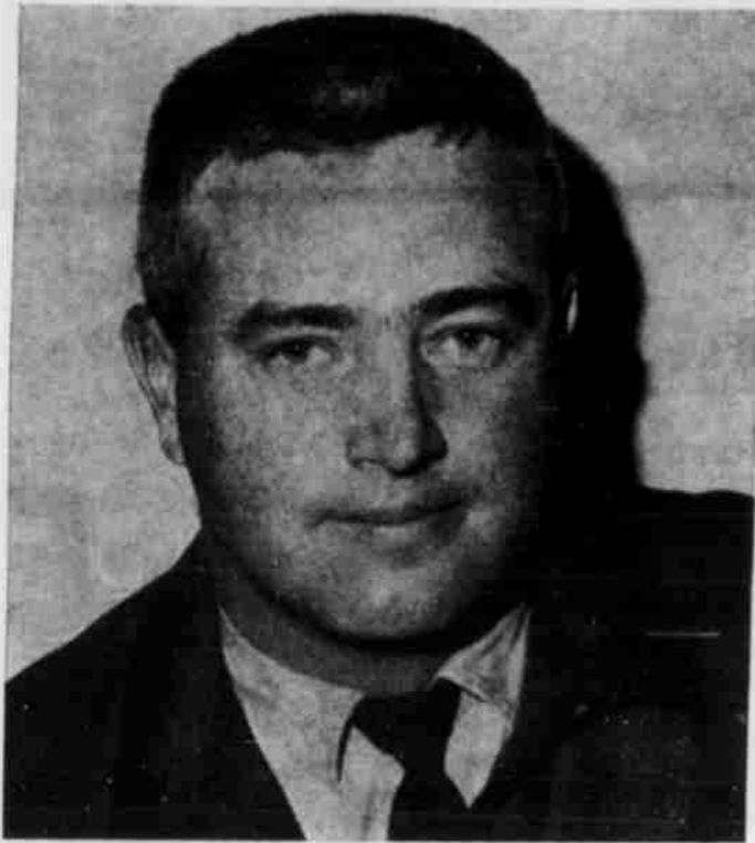
DEMOCRAT CANDIDATE FOR SHERIFF