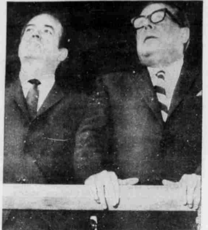
VICE PRESIDENT HUBERT HUMPHREY and Senator Warren Magnuson of the State of Washington watch the gate lift on the John Day Dam lock Saturday at climax of dedication ceremonies. The vice president had just closed a switch to activate the gate's opening from the dedication stand about a quarter-mile from the lock.

Chamber Members, Lions Tour PGT Compressor Plant