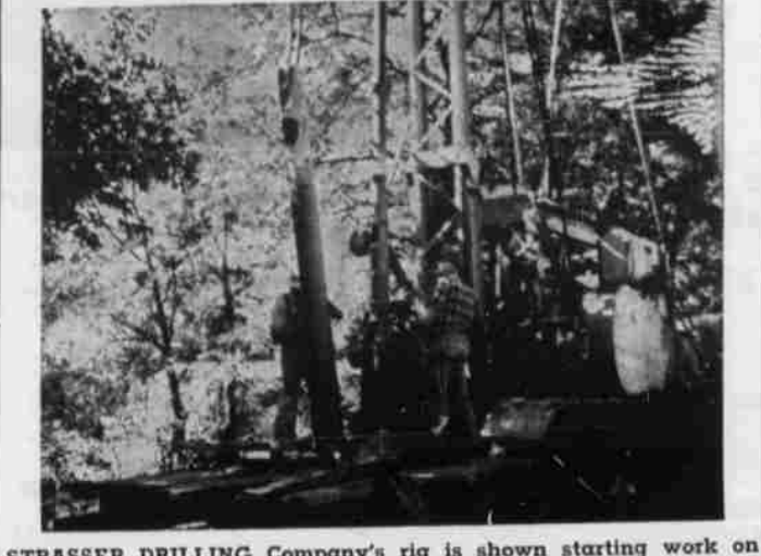
STRASSER DRILLING Company's rig is shown starting work on Well No. 1 at Irrigon, which has been in planning stages for several years.