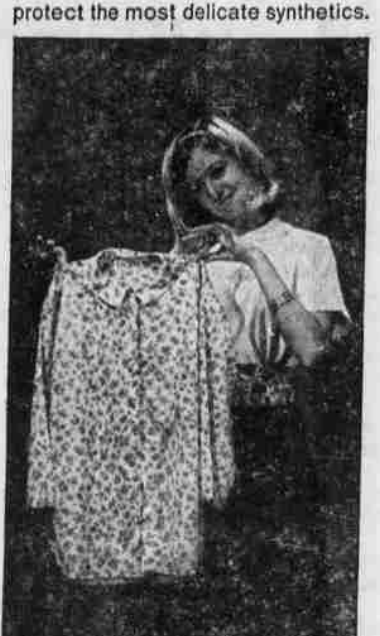
Both washer and dryer have special controls to gently care for dainty garments. You should, however, wash and dry them separately from the rest of your laundry.

laundried automatically A little care is all that's needed to