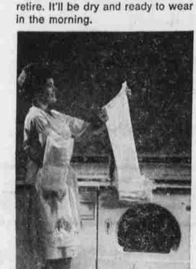
Small wonder that an electric clothes dryer is a woman's most

10-12-20-24 Wides and Up to 65' in Length TRADES-TERMS MOBILE HOME ACCESSORIES