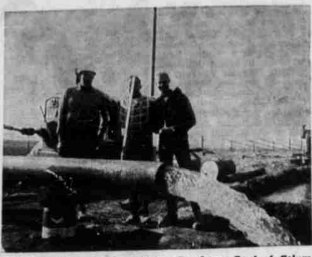
Bill Rice of Inter-Valley Drilling Co., Larry Byrd of Columbia Pump Co. and Ken Turner watch flow of new well at Turner Ranch.

Drilled by Inter-Valley Drilling Co., Island City, and Tested by Columbia Pump, Pendleton, this Well Tested a Stable Pumping Level at 2000 gals. per minute.