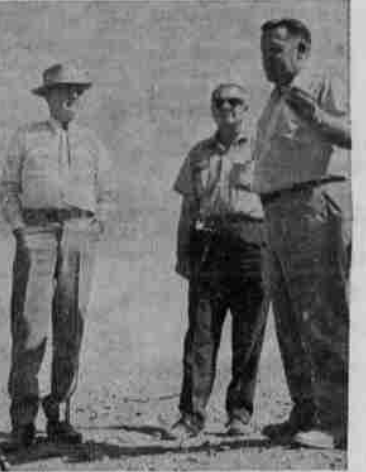
country people ...