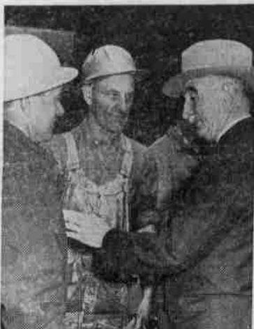
blue-collar workers ...