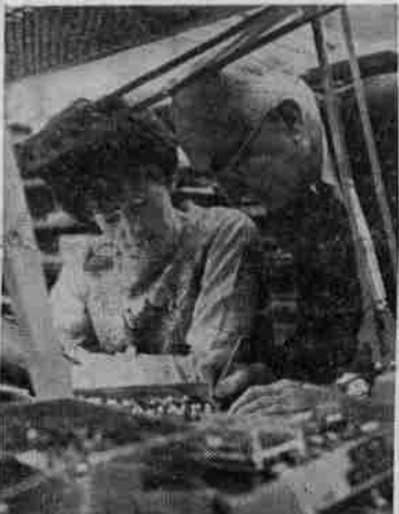
city people ...