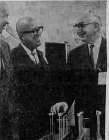
white-collar workers ...